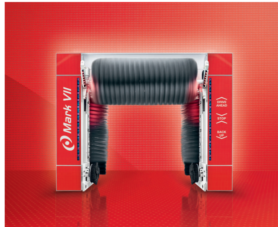
Modern Traffic light – text